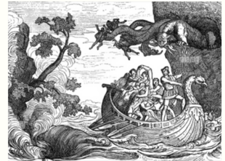
Ulysses and his men fight against Scylla, illustration of the Odyssey, 1880