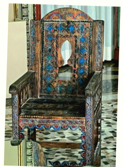
Detail of Tavolo Love Difference - Michelangelo Pistoletto