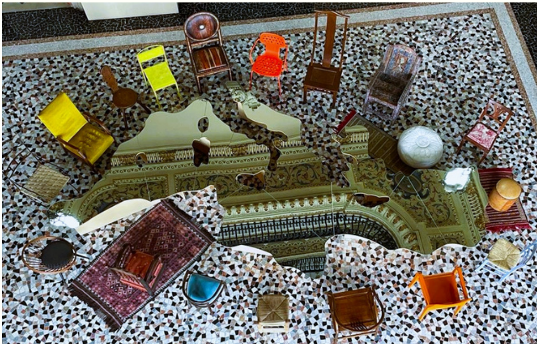
Tavolo Love Difference - Michelangelo Pistoletto

Hotel Perla del Golfo Terrasini, PALERMO