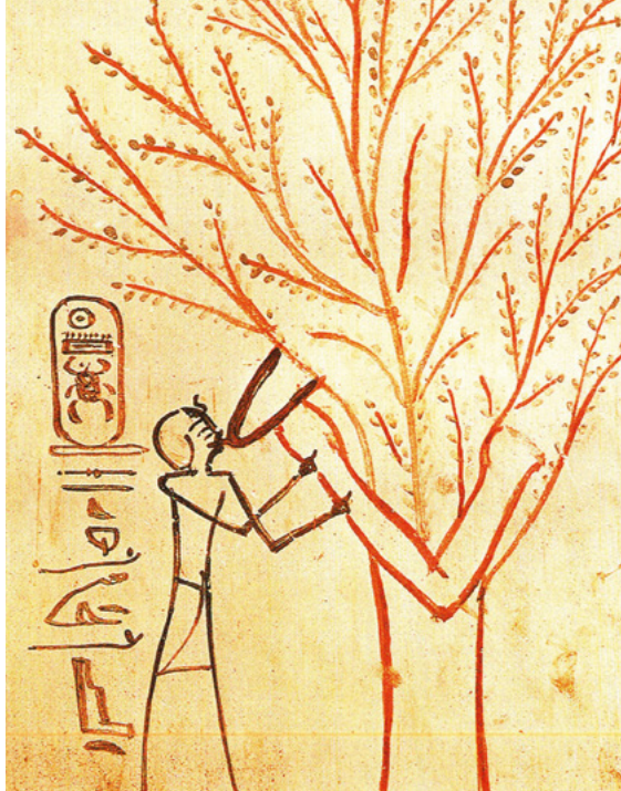
The tree of life, ancient egyptian art.